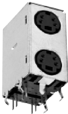
PCB Connectors DMD4FRA111

Contact Switchcraft for additional product information