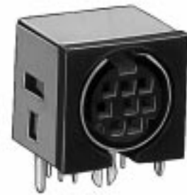
PCB Connectors SMD8FRA010 Also available in 4 contacts, Part # SMD4FRA010

Contact Switchcraft for additional product information