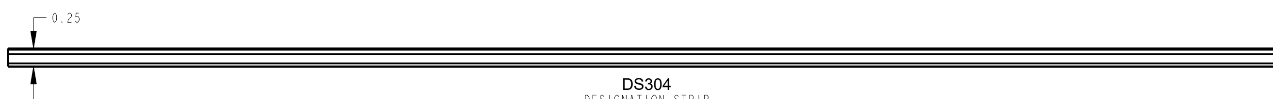
DS304 DESIGNATION STRIP MOUNTING BRACKET BLACK ANODIZED ALUMINUM